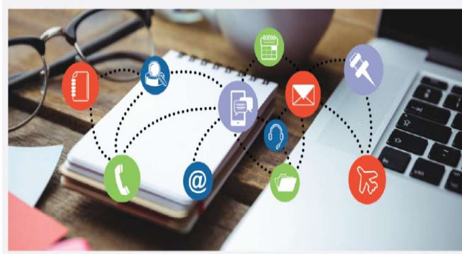
Fig.1 – AduLeT project website (www.adulet.eu)